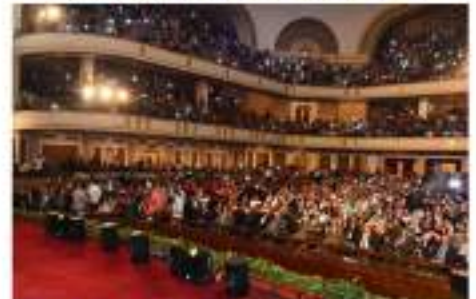
CU is a beacon for culture & fine arts