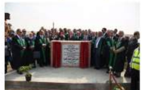
CU: International branch (Est. April 2018)