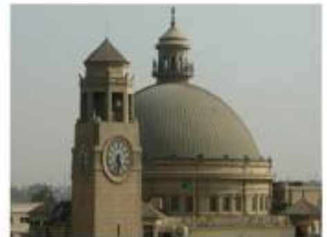
CU is among the oldest three universities in the Arab region